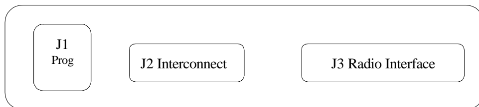
Fig. 1.0 RM-20 Rear Panel Diagram

Electrical installation of the model RM-20 involves connections to a radio receiver and transmitter via J3 (DB-15 male). An optional connector J2 (DB-9 female) is provided for the connection of a telephone interconnect such as the CES model 4700VP. Figure 1 shows the rear panel of the RM-20. Table 1 shows functional information for each pin of the DB-15 male on the rear panel. Table 2 shows functional information on each of the interconnect pins of the (DB-9 female) connector. And Table 3 shows the RM-20 programming jack.